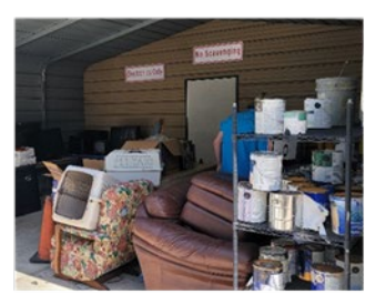
Figure 8.4: Rural Collection Centers