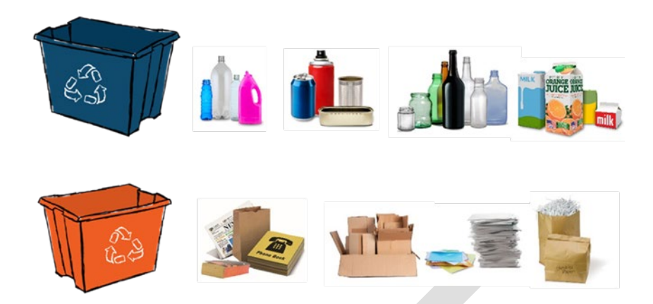
Figure 8.3: Dual Stream Recycling System

The five RCCs positioned throughout the County offer recycling (plastic, metals, glass, mixed paper, cardboard), household hazardous waste disposal, yard waste recycling, bulk material disposal, and garbage waste disposal. The Leveda Brown Environmental Park accepts recycling (plastic, metals, glass, mixed paper, cardboard), scrap metal, tires, yard waste, and household hazardous waste; garbage disposal, and provides further educational outreach to the community.