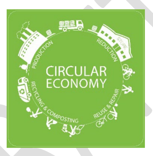
Figure 8.5: Circular Economy

A key principle within Zero Waste is the establishment of a Circular Economy. Circular Economy is a whole-system approach is based upon repositioning disposal and reuse opportunities. Through this process, less raw materials are consumed for production, more manufactured materials remain in use, and commodities are recycled to continue to maximize the value of material. This concept allows resources to have a continuous life cycle through multiple uses and purposes, rather than limiting their life space to simple production that results in waste.