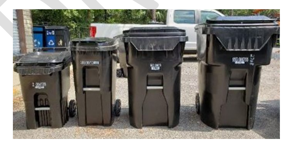
Figure 8.2. Pay-As-You-Throw (PAYT) rate structure

Waste collection for residents within the County varies based upon location. The County provides weekly waste and recycling collection within the designated mandatory curbside collection area. Garbage cart sizing is currently a Pay-As-You-Throw (PAYT) rate structure with annual costs ranging from $203.89 /yr. (20-gallon) to $330.00 / yr. (96-gallon) (Figure 8.2). Recycling is collected utilizing a dual stream system in orange and blue 18-gallon bins to separate recyclables (Figure 8.3). Educational programs and materials are provided through the County's Solid Waste and Resource Recovery Department. County residents outside the mandatory curbside collection area may subscribe to curbside pickup through private services with any of the franchises waste haulers in the County or utilize the Rural Collection Centers (RCCs) or the Leveda Brown Environmental Park.