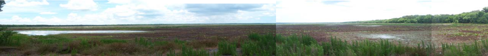
View of Ledwith Prairie.