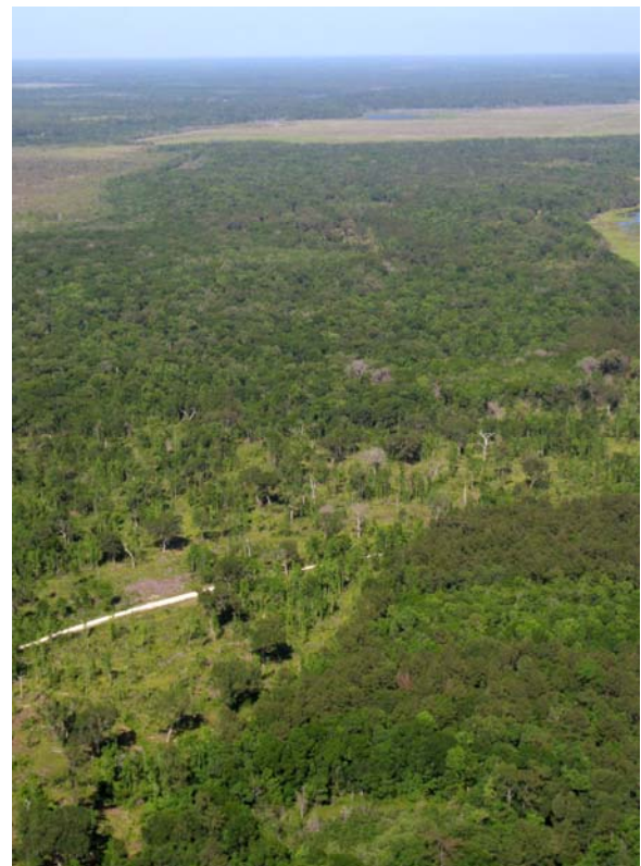
Barr Hammock.