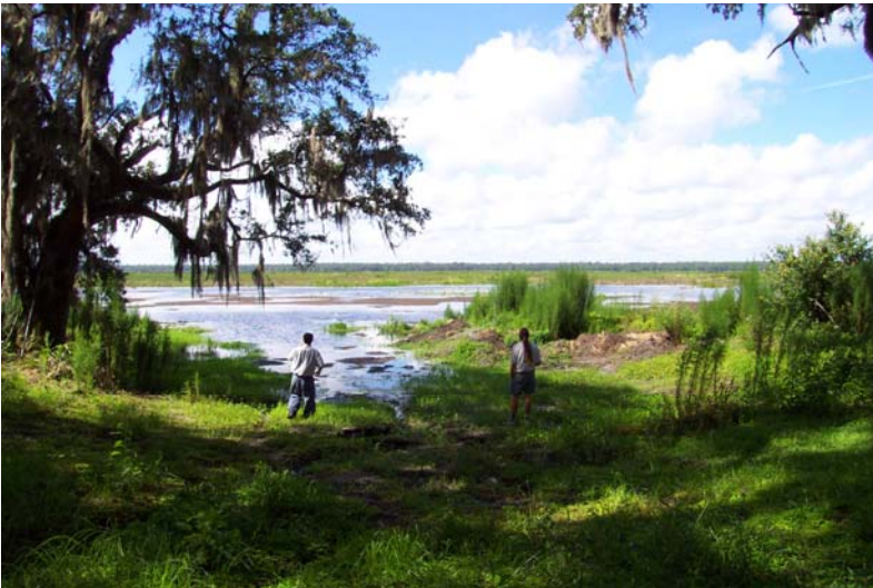
The Land Conservation Board on tour of the project.