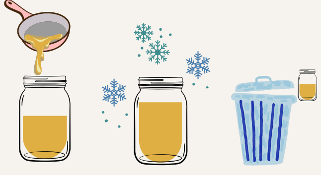
CAN IT. COOL IT. TOSS IT. OR REUSE IT!

Wipe out oily pots and pans with paper towels and put in the trash. Some FOGs can be saved and reused. Never pour it down the drain, instead: