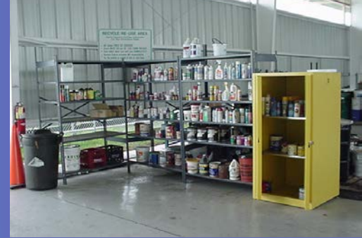
Reuse/Recycle Areas for Household Products

Hazardous Waste Collection Funded by Solid Waste Assessment FY2012 Budget = $700,000 (4.98 FTEs) Proper Disposal and Recycling of Hazardous Wastes from Households and Small Businesses