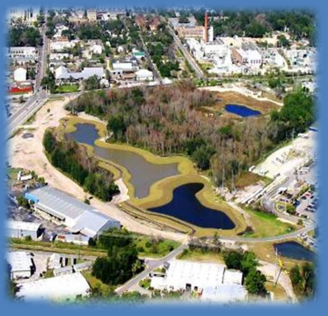
Cabot Koppers Superfund Site