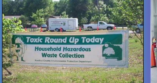
Neighborhood " Toxic Round-up " Collections