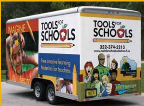
The Tools for Schools Mobile Unit travels to Alachua, Archer, Hawthorne, High Springs, Micanopy, Newberry, and Waldo to provide supplies for teachers.

Benefiting the children and teachers in the communities of Alachua, Archer, Gainesville, Hawthorne, High Springs, La Crosse, Micanopy, Newberry, and Waldo.