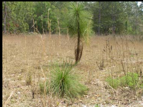
Longleaf Pine Regeneration in the Sandhill Habitat.