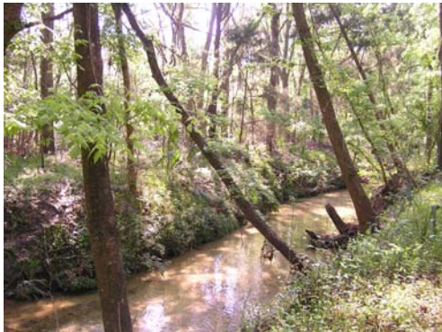
Sweetwater Branch creek flowing through the property.