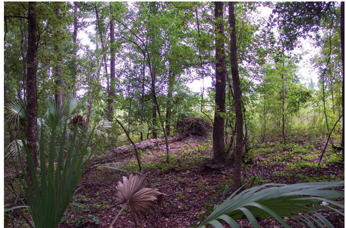
Flatwoods on the property