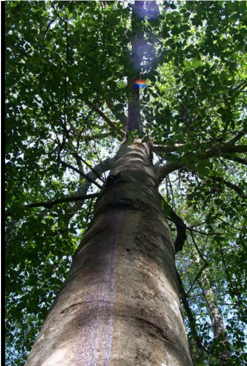
American Beech Tree, Fagus grandiflora . Mill Creek is home to the southernmost Beech-Magnolia forest habitat in the U.S.

Date: November 8, 2002 Purchase Price: $2,380/acre Sellers: Lybass family Size: 1,190 acres