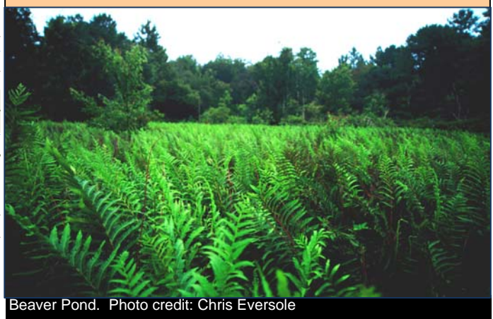
Beaver Pond.