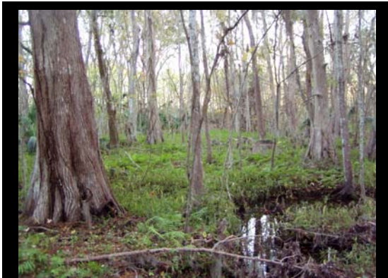
A cypress dome on the Bishop & Henderson parcel