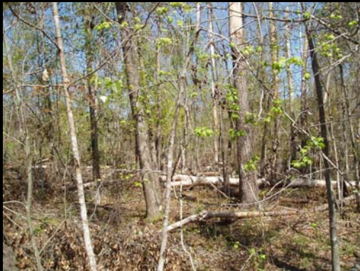
Second growth hardwood forests