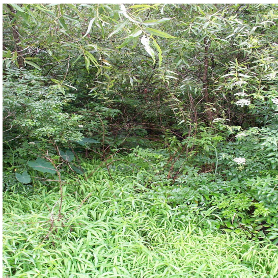
Calf Pond Creek during the dry season

Calf Pond Creek flows through several commercial and industrial areas where potential point sources of pollution may exist. The only point source currently re-