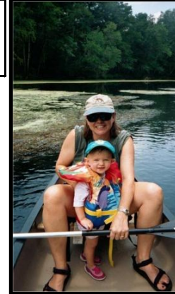
Santa Fe River