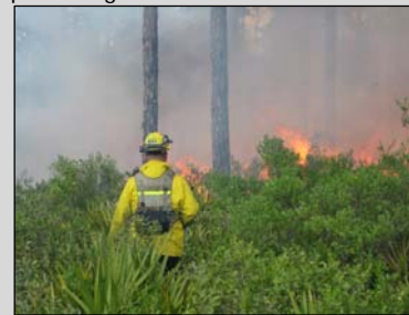
Prescribed Burn at Balu Forest.

ACF has been working with the State of Florida Division of Forestry and been able to pull off two burns this year. We are prepared to burn additional acreage this summer, weather and other conditions permitting.