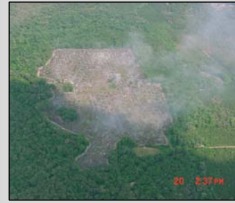
Prescribed Burn at Barr Hammock.

As part of the County's FY11 budget reductions, the Wildfire Mitigation Team was eliminated. One position and some equipment were transferred to EPD to continue the Prescribed Fire function. Florida contains pyrogenic habitats meaning they need periodic fire to sustain them. Historically lightning strikes and later Native Americans would light the fires. Now land managers have to provide this critical function under carefully controlled conditions.