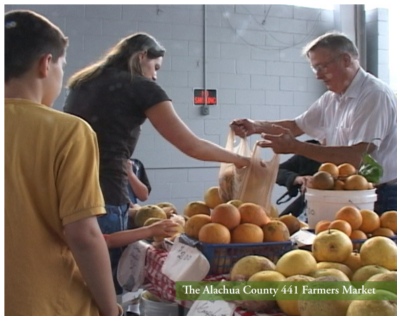
The Alachua County 441 Farmers Market