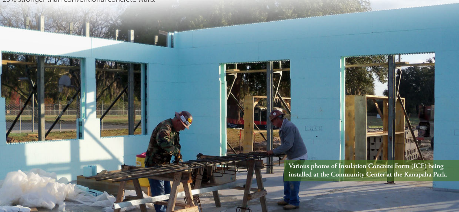
Various photos of Insulating Concrete Form (ICF) being installed at the Community Center at the Kanapaha Park.

The project is scheduled to be completed in April-May 2012.