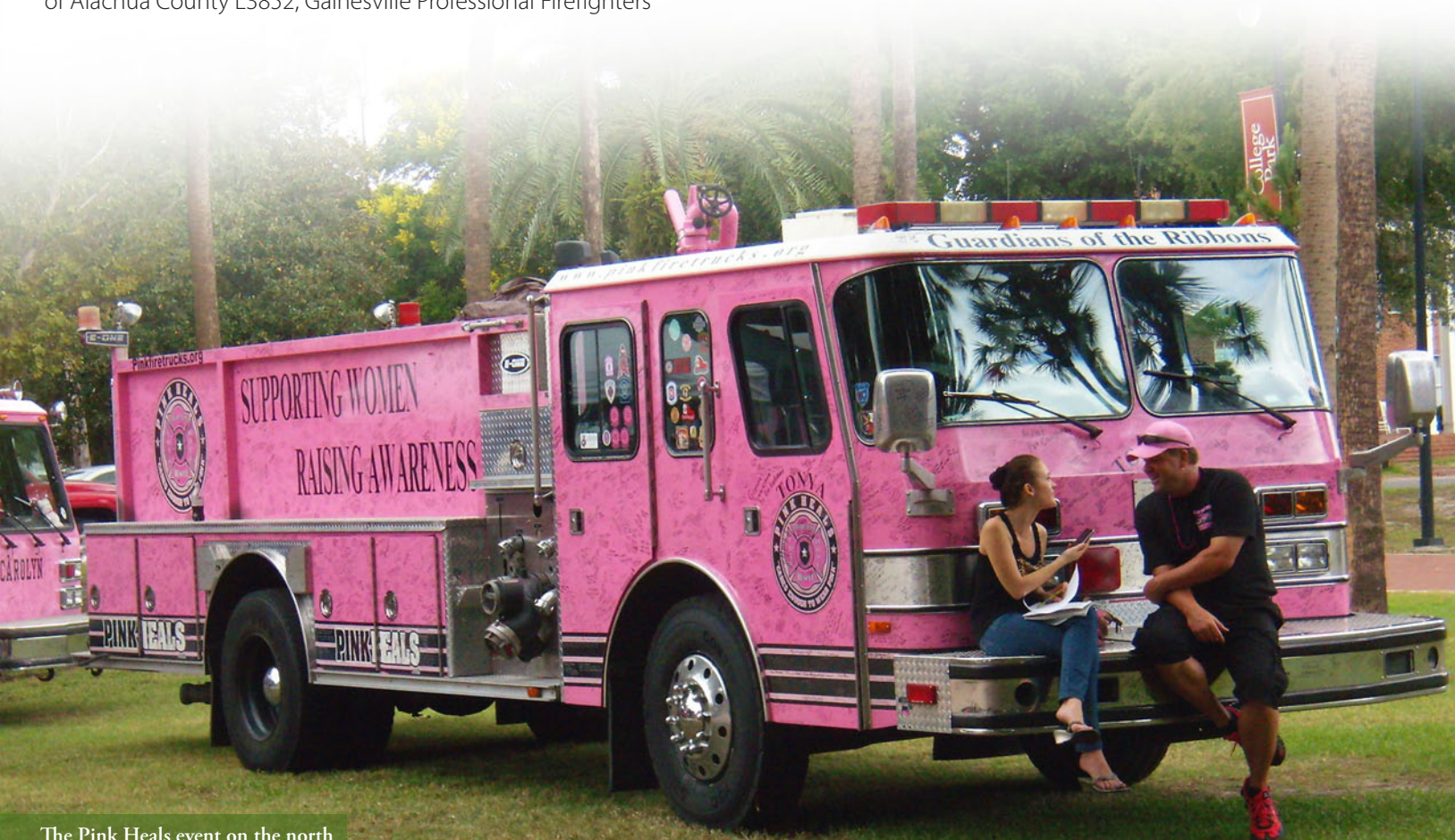
The Pink Heals event on the north lawn of Ben Hill Griffin Stadium