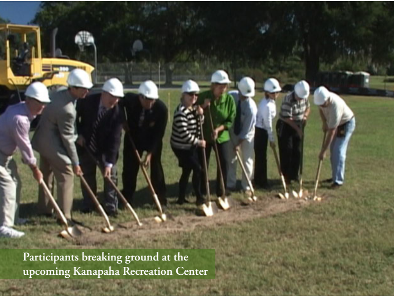
Participants breaking ground at the upcoming Kanapaha Recreation Center

The Alachua County Commission celebrated the Groundbreaking Ceremony for the Kanapaha Park Recreation