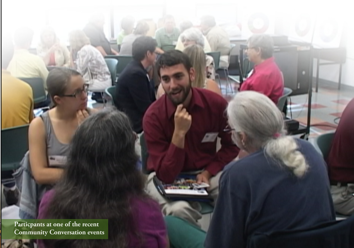
Participants at one of the recent Community Conversation events