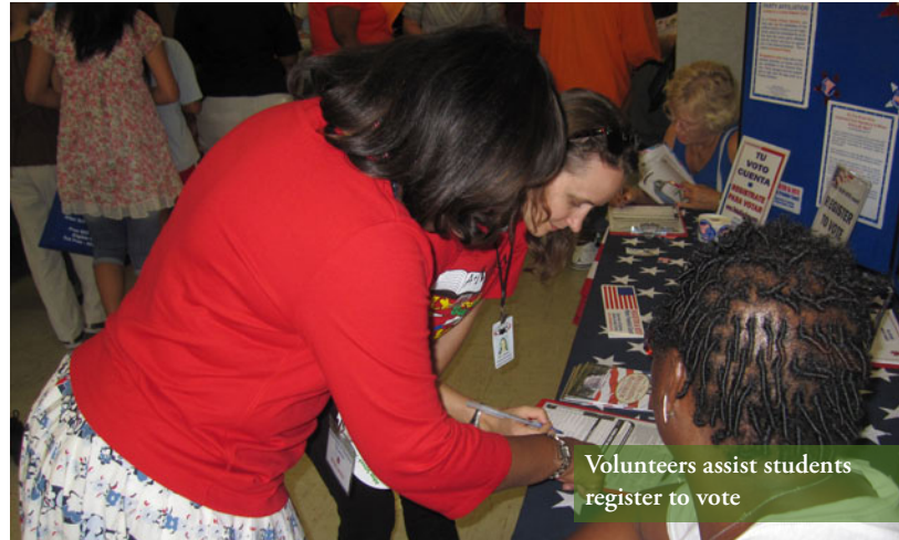
Volunteers assist students register to vote

On August 15th the University of Florida New Graduate Student Orientation was held on the University of Florida campus. Representatives from the Supervisor of Elections Office registered fifty-seven new voters and provided voter information to the 1200 students in attendance.