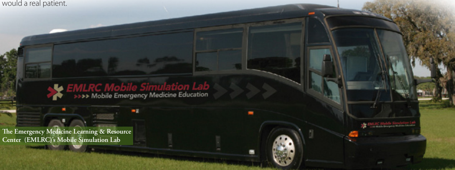
The Emergency Medicine Learning & Resource Center (EMLRC)'s Mobile Simulation Lab