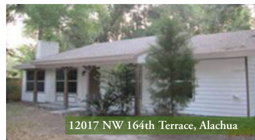
12017 NW 164th Terrace, Alachua