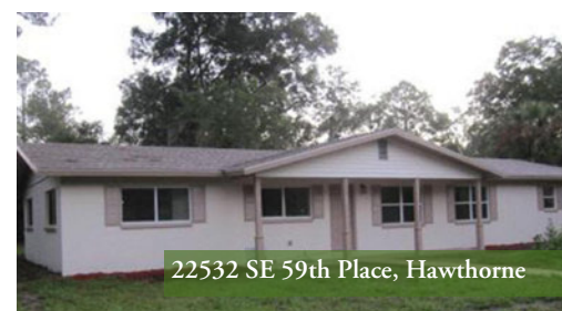
22532 SE 59th Place, Hawthorne