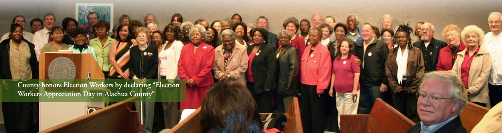
County honors Election Workers by declaring "Election Workers Appreciation Day in Alachua County"

If you are interested in serving as a Poll Worker or Phone Bank Operator, you may fill in the Poll Worker application on our website at www.VoteAlachua.com or call the Supervisor of Elections Office at 352-374-5252.