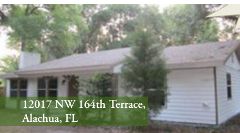
12017 NW 164th Terrace, Alachua, FL

The Alachua County Department of Growth Management is pleased to announce that purchase offers are now being accepted for three recently renovated homes purchased by Alachua County through the Neighborhood Stabilization Program, (NSP). One home is located in unincorporated Alachua County at 3713 SE 14th Terrace; one home is located at 3009 NE 11th Terrace, in northeastern Gainesville. The third home is located at 12017 NW 164th Terrace, Alachua, FL.