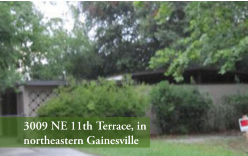
3009 NE 11th Terrace, in northeastern Gainesville