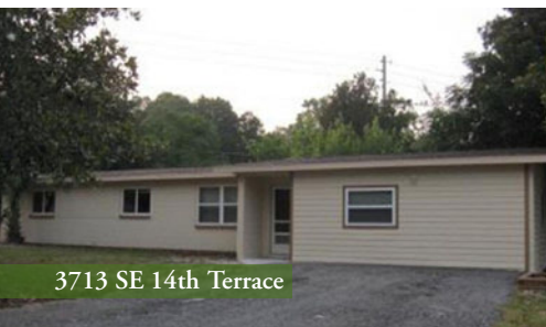
3713 SE 14th Terrace

Each home features a new roof, Energy Star windows, appliances and has been painted inside and out, providing an opportunity for a low to moderate income family to buy a home at an affordable price. Homes are being renovated to bring them into compliance with the standards of the minimum housing code as well as to increase the energy efficiency of each home. Three NSP homes have been sold to date.