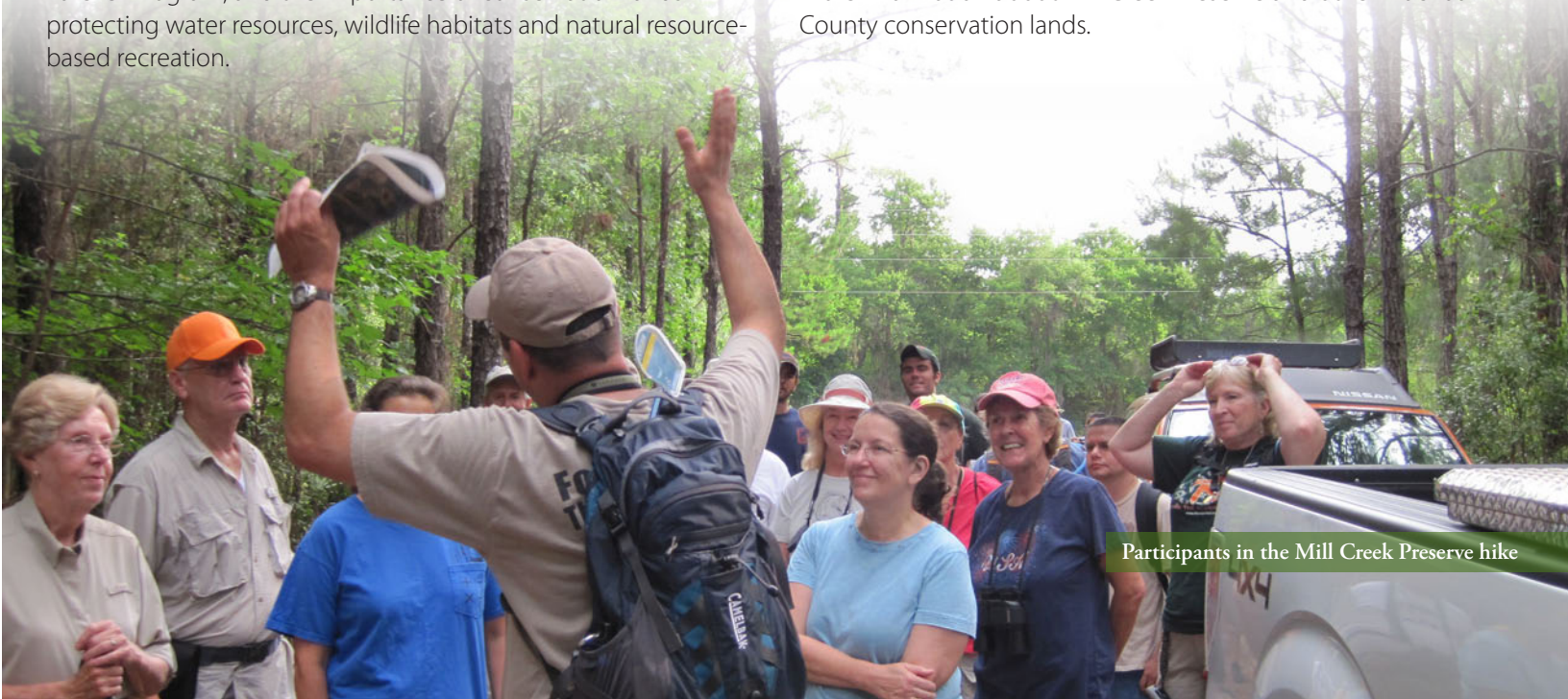
Participants in the Mill Creek Preserve hike

Those who missed this event can hike the scenic nature trails in Mill Creek Preserve. Click here to visit the County's website for more information about Mill Creek Preserve and other Alachua County conservation lands.