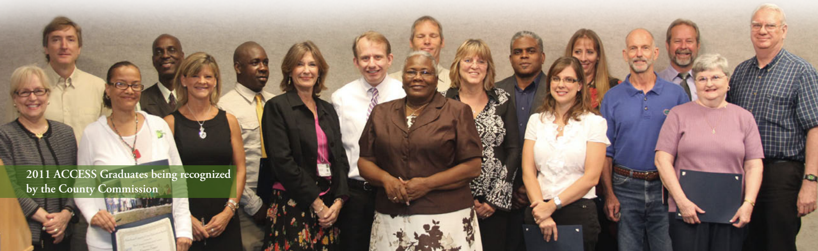
2011 ACCESS Graduates being recognized by the County Commission

Attachment: Elder_Abuse_AlachuaCo_2011.pdf