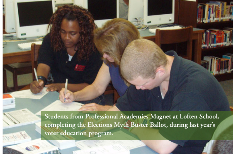
Students from Professional Academies Magnet at Loften School, completing the Elections Myth Buster Ballot, during last year's voter education program.

The Alachua County Supervisor of Elections Office is visiting area high schools educating seniors on the importance of voting. Students will learn about the electoral process, have an opportunity to cast a ballot on the County voting equipment, and most importantly have the opportunity to register to vote.