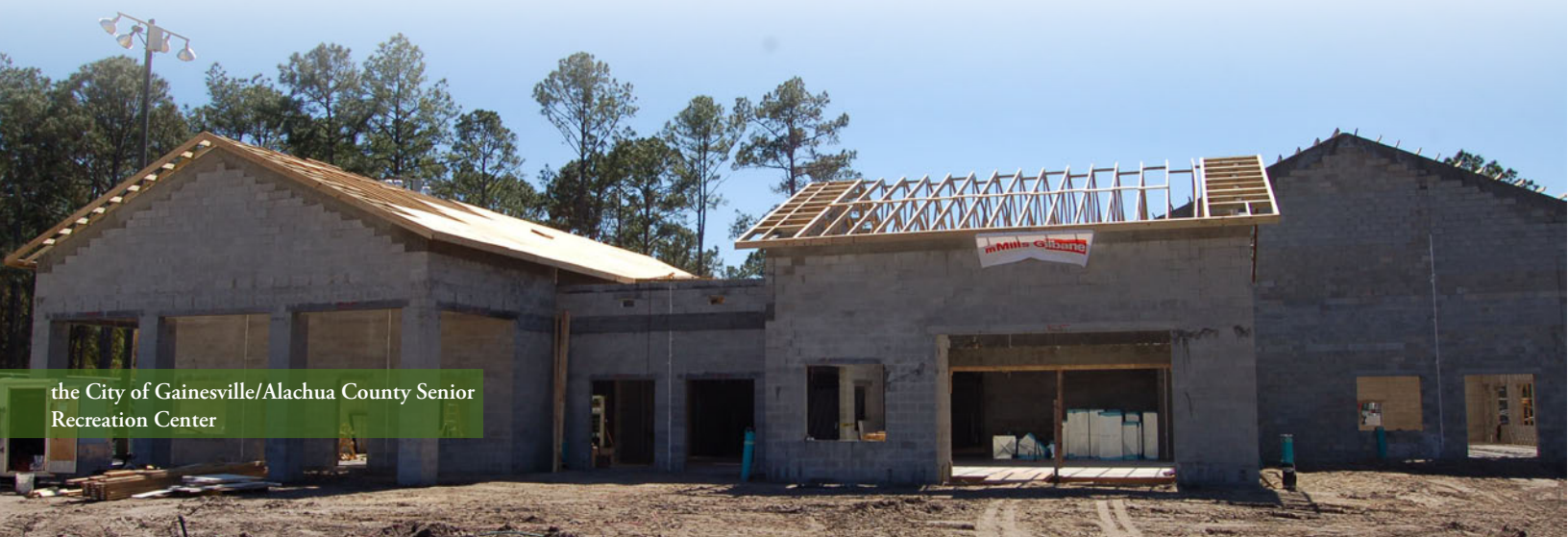
the City of Gainesville/Alachua County Senior Recreation Center