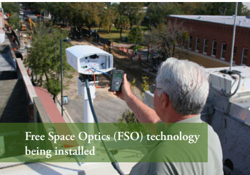
Free Space Optics (FSO) technology being installed

The Alachua County Information and Telecommunication Services (ITS) announced that as of February 22, 2011, the County's Guardian ad Litem program has been utilizing Free Space Optics (FSO) technology to connect its new office, in the newly renovated Department of Corrections building (105 SE 1st Street, Suite 7, Gainesville) to the existing Alachua County network.