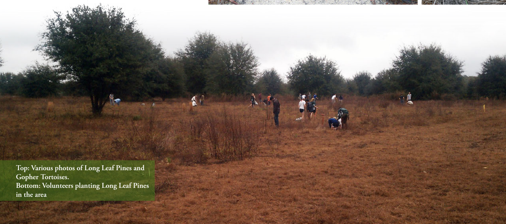
Top: Various photos of Long Leaf Pines and Gopher Tortoises. Bottom: Volunteers planting Long Leaf Pines in the area