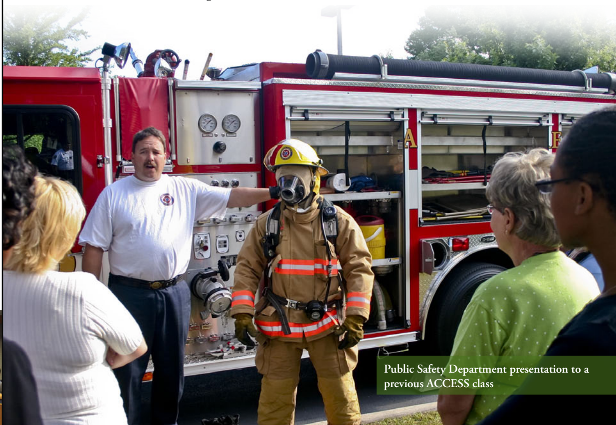
Public Safety Department presentation to a previous ACCESS class

For more information, or to register call 352-374-5219.