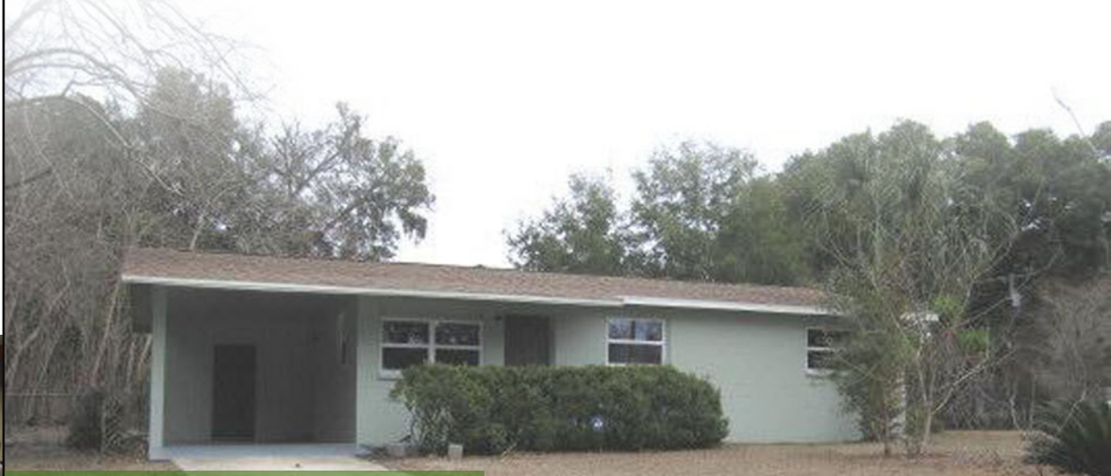
Home for sale at 1631 S.E. 37th Street, Gainesville

Homebuyers must meet NSP income requirements. For example, a family of 4 earning $73,560 may be eligible to buy an NSP home. Buyers are required