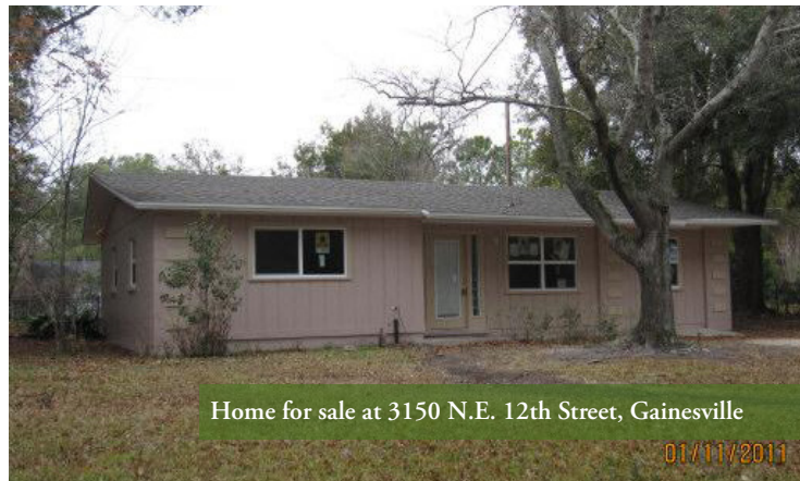
Home for sale at 3150 N.E. 12th Street, Gainesville

The Alachua County Department of Growth Management is pleased to announce that purchase offers are now being accepted for two single family homes purchased and repaired through the Neighborhood Stabilization Program, (NSP). The two homes for sale by Alachua County are located at 3150 N.E. 12th Street and 1631 S.E. 37th Street, in Gainesville.