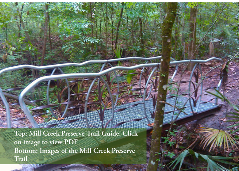
Top: Mill Creek Preserve Trail Guide. Click on image to view PDF Bottom: Images of the Mill Creek Preserve Trail

To sign up for the guided walk or for more information contact Alachua County Senior Environment Specialist, Kelly McPherson at 352-264-6848 or kmcpherson@alachuacounty.us .