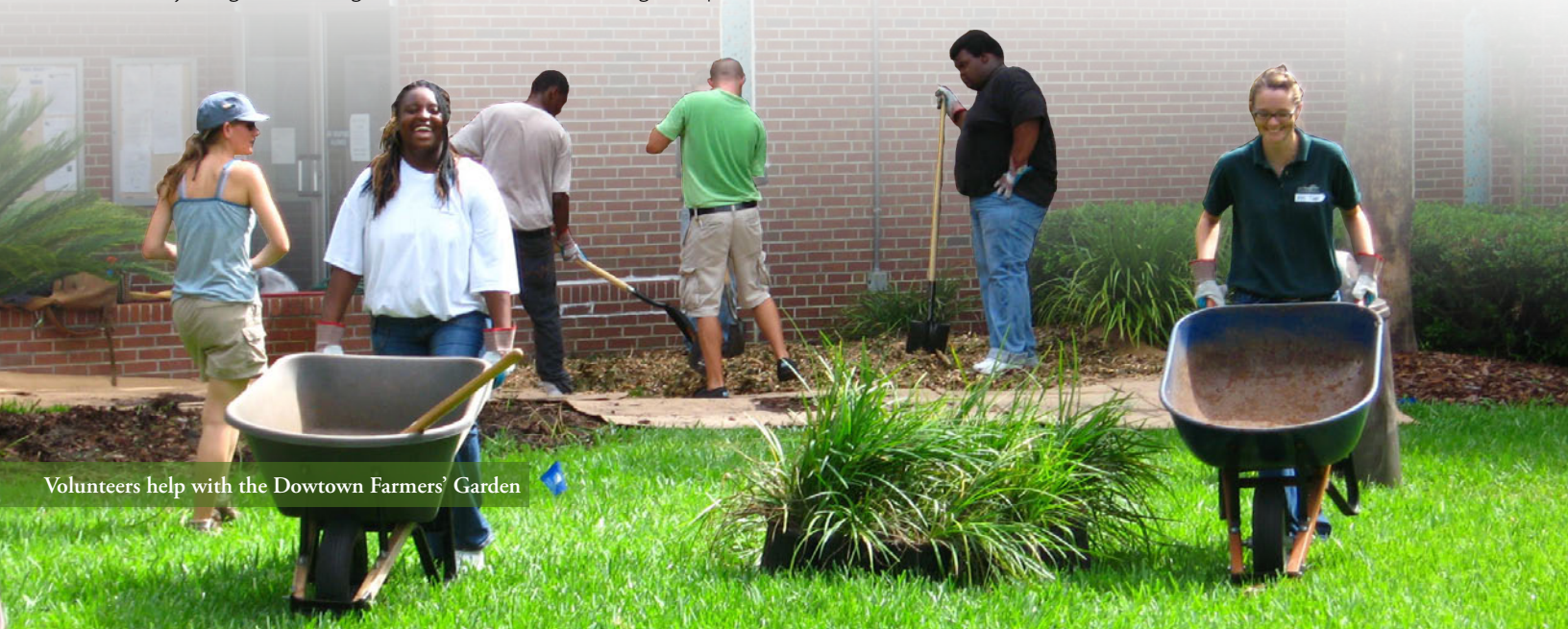
Volunteers help with the Downtown Farmers' Garden

For more information, contact Sean McLendon at 352-548-3765.