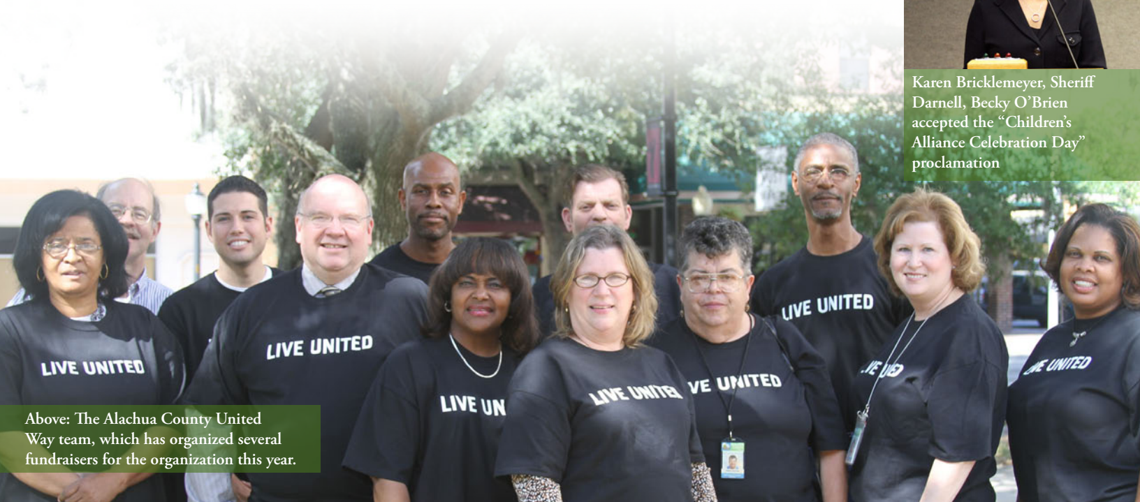
Above: The Alachua County United Way team, which has organized several fundraisers for the organization this year.