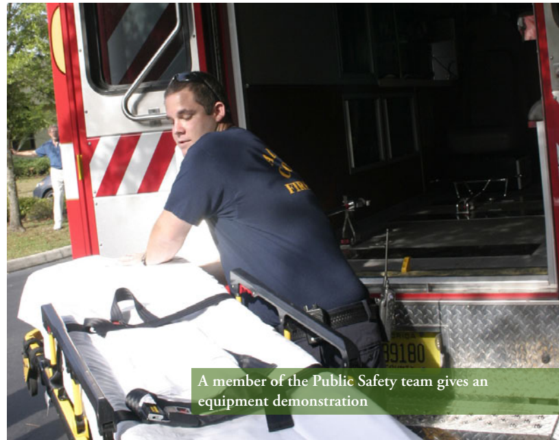
A member of the Public Safety team gives an equipment demonstration