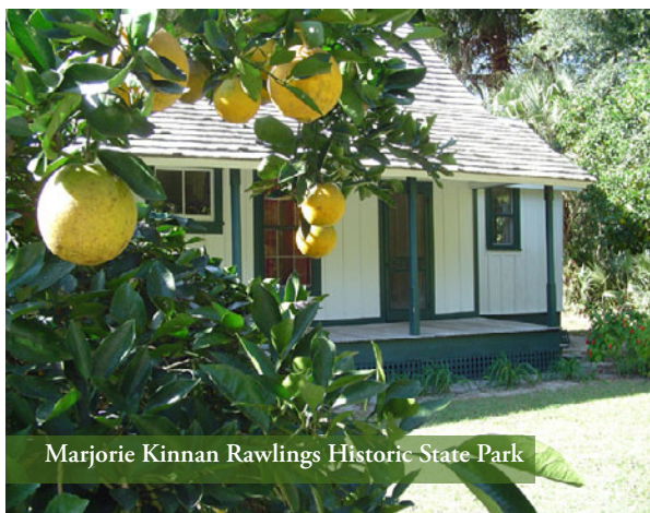
Marjorie Kinnan Rawlings Historic State Park

We strongly recommend insect repellent and sunscreen. Bring a refillable water bottle, and wear hat and gloves, hiking boots, or work shoes if you have them. The park will provide cold water for drinking, and a pair of used, light cotton gloves for those that need them. If you have a hammer, or pruning shears, they might come in handy. Children are welcome, but must be a minimum of age 12, accompanied by an adult.