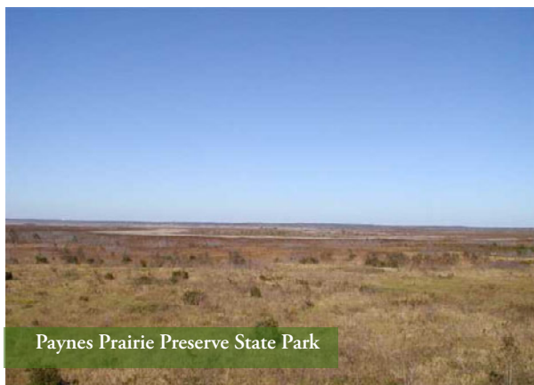
Paynes Prairie Preserve State Park

Upon completion of the project, participants are invited to explore the park at their leisure, including observing wildlife at the La Chua trail, visiting our recreation area, Visitor Center, 50 foot observation tower, or hiking or biking along one of our many trails.