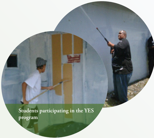
Students participating in the YES program

The YES program recruits, screen, and readies young people for employment in Alachua County workplaces. YES matches skills with work to prepare students to enter the job market. Students work in various departments of Alachua County Government. Students are paid for their work, and receive valuable job experience.