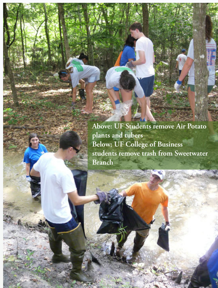
Above: UF Students remove Air Potato plants and tubers Below: UF College of Business students remove trash from Sweetwater Branch

Ratkus waded through the water to collect 500 pounds of trash and several car tires from the creek section within the preserve's boundary. It was the largest quantity of trash collected in July's creek & river clean-ups organized by Current Problems Inc. for UF's College of Business. The City of Gainesville has installed a few trash traps in the stormwater drains to reduce trash getting in the urban creeks, but littering is still too common for these traps to eliminate waste into our surface waters. While removing