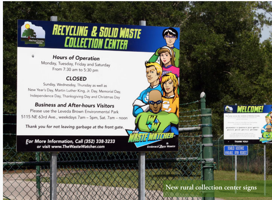
New rural collection center signs