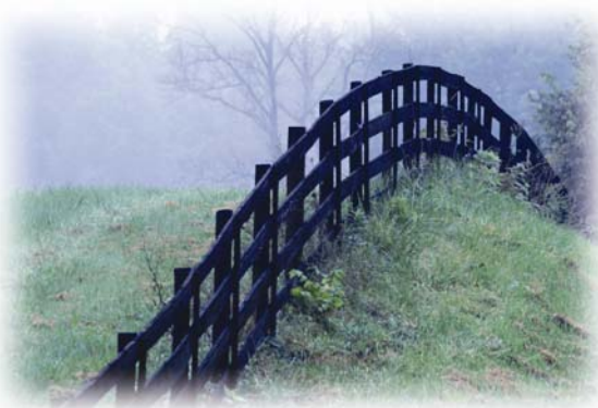
“Understanding makes good neighbors.”

The bottom line: If you don’t have permission, don’t go on to private property!